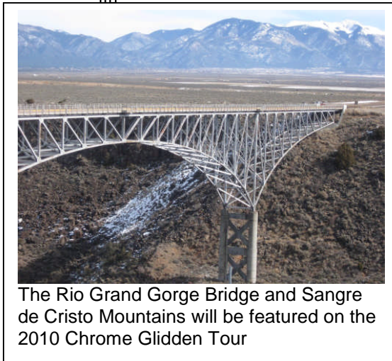
The Rio Grand Gorge Bridge and Sangre de Cristo Mountains will be featured on the 2010 Chrome Glidden Tour