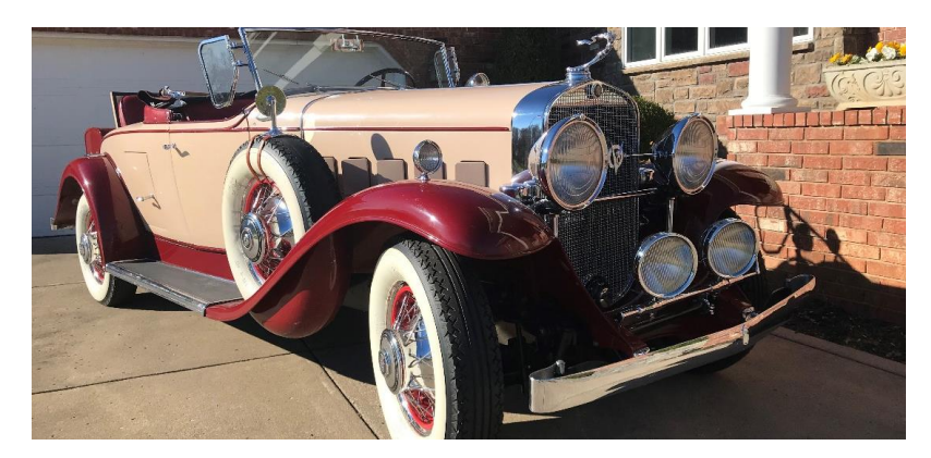
The Best CCCA Recognized Classic Car Driven on a VMCCA Tour