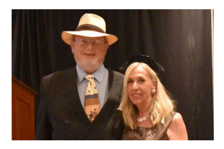
Sponsored by Great Lakes Region

For their Outstanding Service to the VMCCA