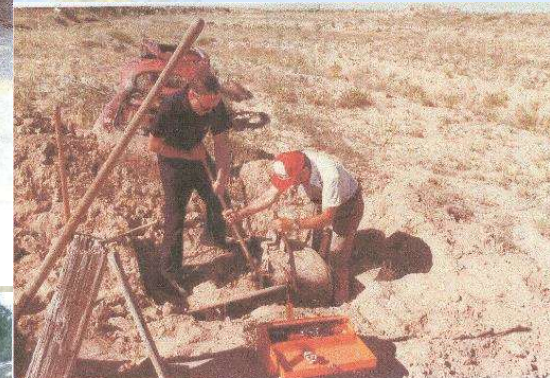
BE CAREFUL NOT TO DAMAGE THE IGNITION SWITCH KEN