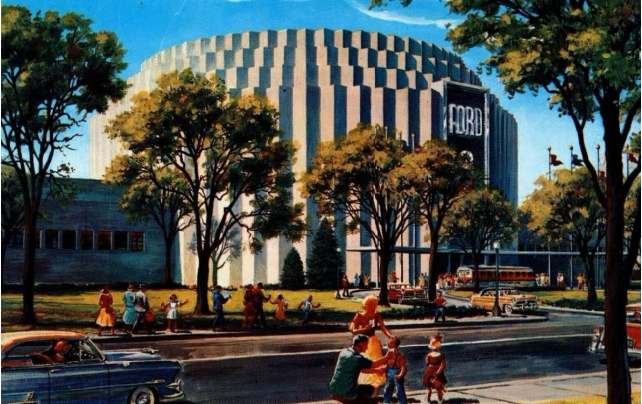
Artist Tom Schenk's 1950s rendering of the Ford Rotunda. Tom Schenk

Ford called it the "Show Place of the Automotive Industry," and even a title that brazen may have understated the widespread appeal of the Rotunda. By the early 1960s, Ford's futuristic Rotunda was not only the most popular automotive-related tourist destination in the United States, it was the fifth-most visited attraction overall, seen by more people than the Statue of Liberty, the Washington Monument, and Yellowstone National Park.