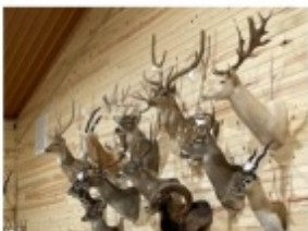
One of several impressive taxidermy displays at Seven E.