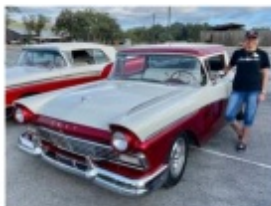
Shawn Reaves with the latest addition to the Reaves stable, her 1957 Ford Ranchero, next to...

The October 12, 2022 Car Tour, first dubbed "The Mystery Tour," was hosted and led by Henry & Jo Nell Blechl from the parking lot of The Bridge Church in Fredericksburg to Harper for a visit to the new home of Seven E Taxidermy. Eighteen classic cars and 32 FVCC members blazed the trail to Harper along the rolling hills of Hwy 2093 (Tivydale Road) under typical Texas blue skies.