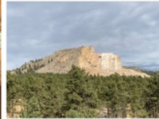
Crazy Horse Monument