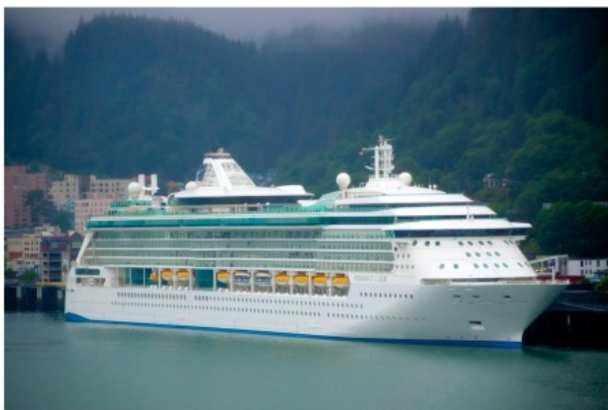
The 2024 VMCCA Annual Meeting