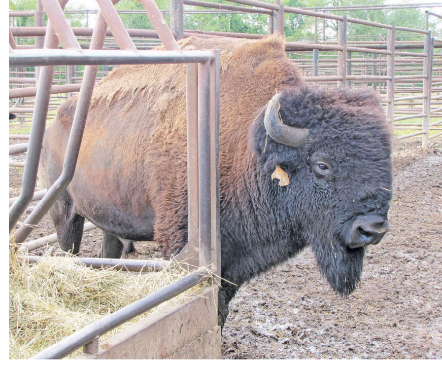
Above: At Red Run Bison Farm.