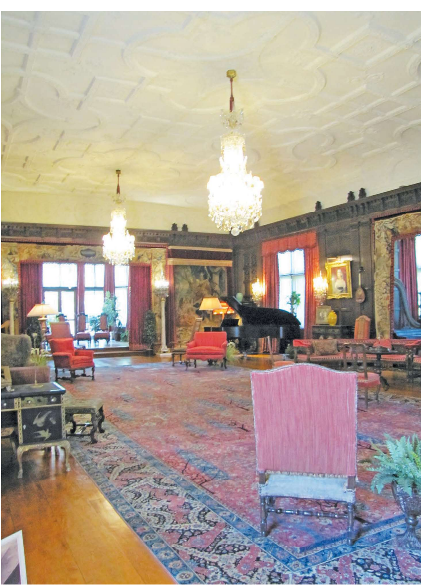
Right: Inside the music room at Stan Hywet Hall.