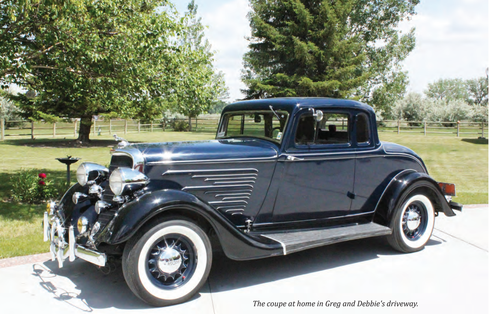
The coupe at home in Greg and Debbie's driveway.

The little 1934 Dodge started right up, and I drove it the few miles home. Sure enough, the rumble seat area was full of boxes with spare parts and literature.