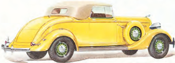
The CONVERTIBLE COUPE