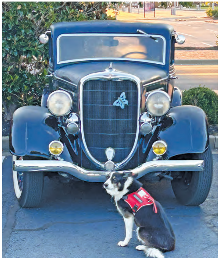
Above: The Childs' canine companion, Round-2, stands guard next to his favorite Dodge.

A trip to a "starter/generator" shop in Salt Lake City produced a much smaller starter with matching engagement dimensions and pinion gear. The only short-lived problem was that the starter was for a 12-volt Honda. Since the battery was beneath the floorboards, I simply changed the system to 12 volts and rewired the generator. The headlights were a bit of an issue. I resolved this by using 12-volt snowmobile bulbs which I was able to fashion into the buckets. By doing so, I retained the charming old look of the headlights. The original 6-volt trumpet horns are attention getting!