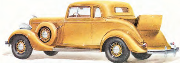
The COUPE WITH RUMBLE SEAT