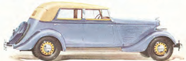
The SPECIAL 121 CONVERTIBLE SEDAN Top up