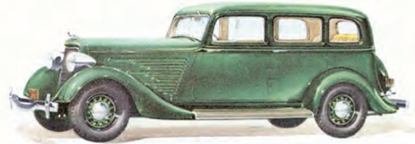
The FOUR-DOOR SEDAN