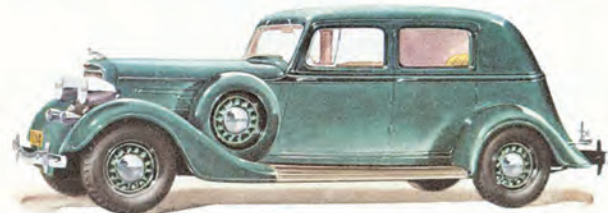
The SPECIAL 121 BROUGHAM