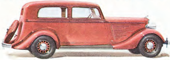
The TWO-DOOR SEDAN