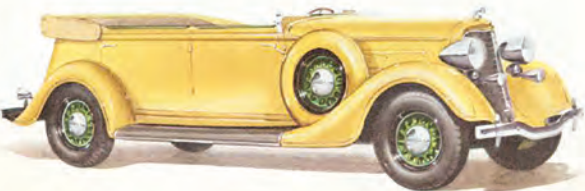
The SPECIAL 121 CONVERTIBLE SEDAN Top down