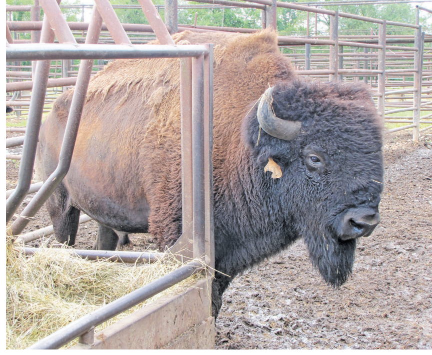
Above: At Red Run Bison Farm.